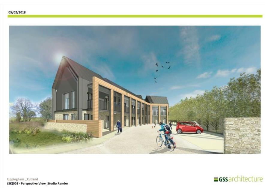
A design from GSS Architecture to stimulate young minds - Feb 24 th 2018